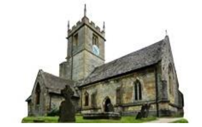
Hampton – Fairfield – Thistledown Eastwick Park – Charity Crescent